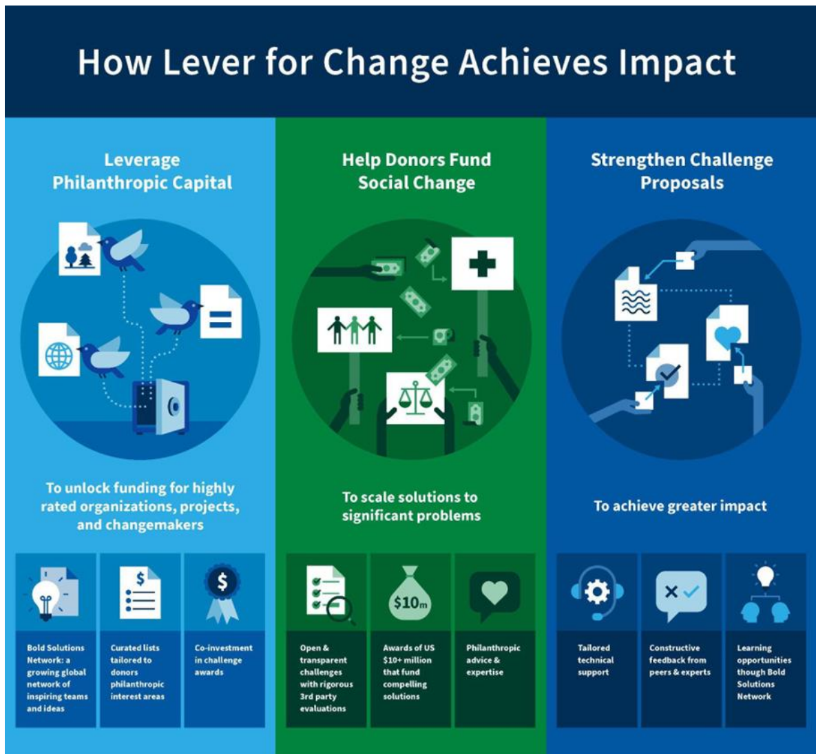
Figure 1. How Lever for Change Achieves Impact